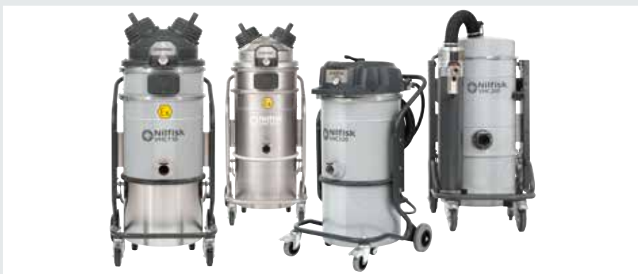
Nilfisk's complete range of compressed air industrial vacuums