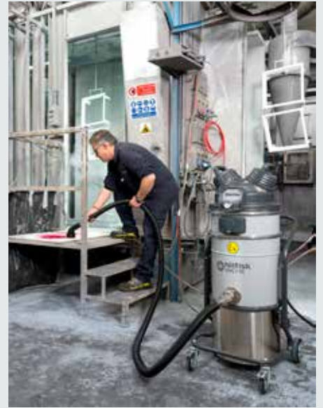
Model VHC110 ATEX equipped with the new ATEX accessories