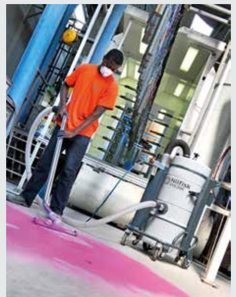
Recovery of epoxy powder from all surfaces