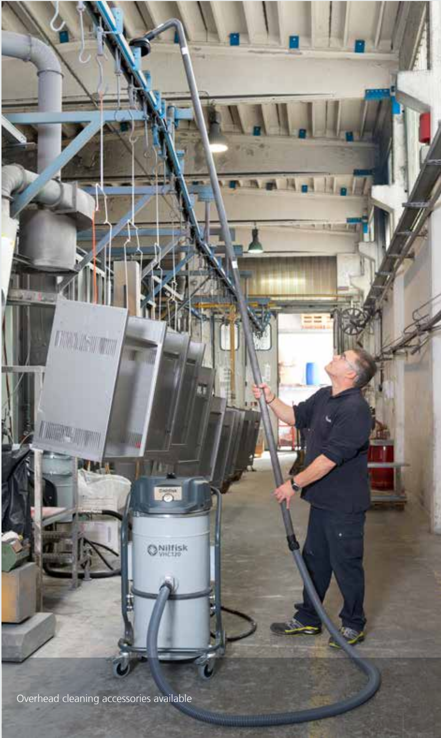
Overhead cleaning accessories available