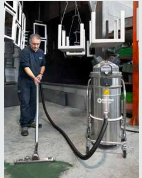
Ensure total safety while cleaning the working environment